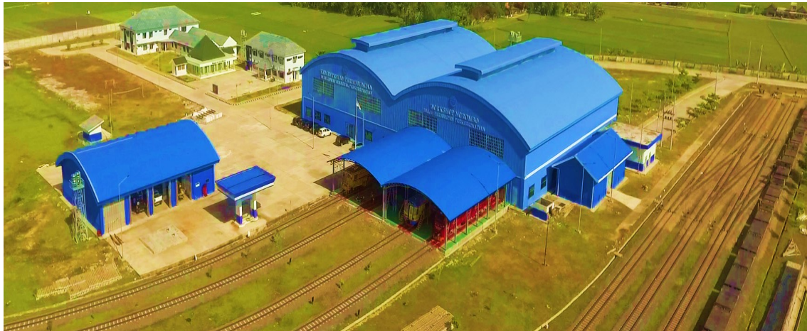
Figure 1. Ngrombo Railway Maintenance Center Workahop, Directorate General of Rail Transportation, Ministry of Transportation (Indonesia)

Keywords: Railway, Rolling Stock, Maintenance, Building, HIRADC, Safety