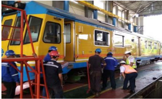
Figure 4. Hazard identification

there is a risk of it falling, which can cause injuries to people and damage to property.