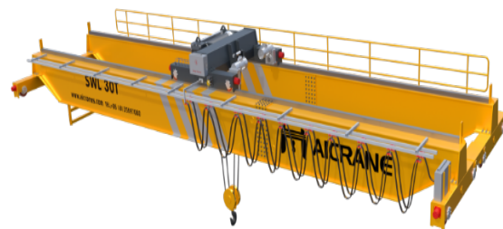
Figure 3. OHTC 3D Detail