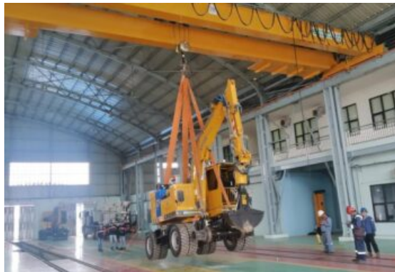
Figure 2. The Ngrombo OHTC

Their structures consist of a mobile platform along the hall with hoisting winch or a trolley moving along girders OverHead Traveling Crane (OHTC) as lifting maintenance equipment specifically in this research in Lifting Body Activities Using OHTC in Maintenance of Hydraulic Diesel Locomotive Facilities has a